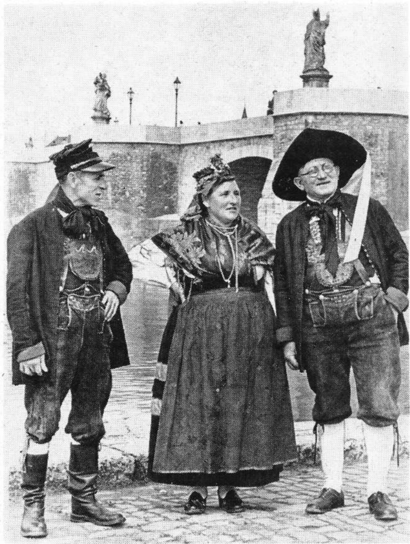
Hummelgauer (bei Bayreuth)